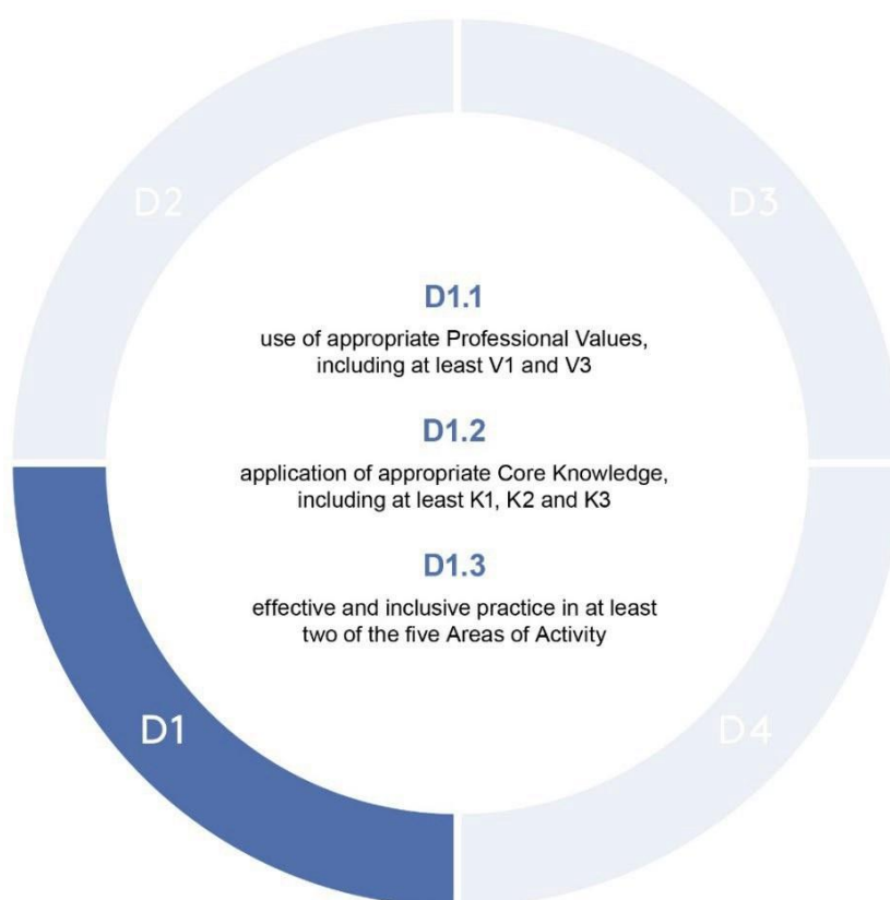
Figure 2: PSF 2023 Descriptor 1 showing the three Descriptor 1 criteria statements D1.1, D1.2, and D1.3

Descriptor 1 is suitable for individuals whose practice enables them to evidence some Dimensions. Effectiveness of practice in teaching and/or support of learning is demonstrated through evidence of: